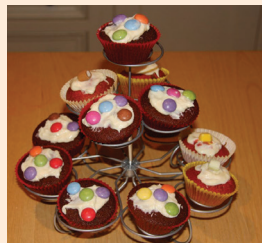
Beware of cakes (including many home made cakes) made with the artificial sweetener xylitol, which is extremely toxic to dogs.