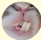
Misaligned and overgrown incisor (front) teeth

Vaccination: Rabbits can be vaccinated against Myxomatosis and Viral Haemorrhagic Disease. Both of these can be rapidly fatal. There are vaccines available that give good protection and are recommended for yearly use. Since myxomatosis can be spread by flies and mosquitoes, it is recommended to have indoor rabbits vaccinated as well. If you would like further information on caring for your rabbit, feeding, dental health and vaccination, please don't hesitate to contact our helpful team.