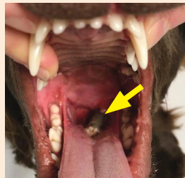
This is a typical stick injury where the stick has become lodged in the dog's throat – see yellow arrow.

Finally – we hope you enjoy the spring with your pets. Signs of poisoning can often be quite vague so please contact us at once if you are at all worried.