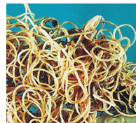
Roundworms are long, white and spaghetti like.

Roundworms are most commonly found in young animals but can infect adults as well. Many pups and kittens are born infected with roundworms because they cross the placenta and are also in the milk. They are spaghetti like in appearance and also live in the small intestines. They can cause weight loss, vomiting, diarrhoea and a pot belly in puppies and kittens. Adult roundworms shed eggs which are passed out in your pet's faeces and infect the environment. Pets can become re-infected by unwittingly eating the eggs, often whilst grooming. Additionally the eggs can pose a risk to humans if accidentally ingested.